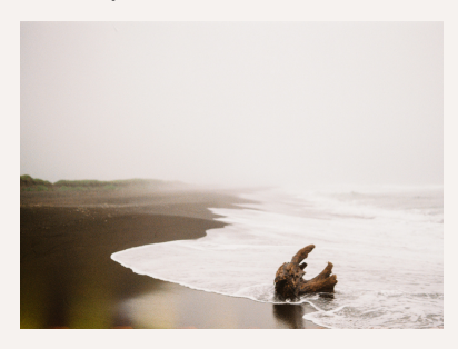
HAVE UPLEVELED THEIR COACHING SKILLS

Through learning, relearning and receiving feedback for further development for their clients sake.