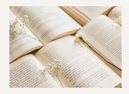
ARE WILLING TO DO THE UNCOMFORTABLE WORK

A SOSHA Mastercoach™ is someone who puts their own development at the forefront for their craft for their clients' sake.