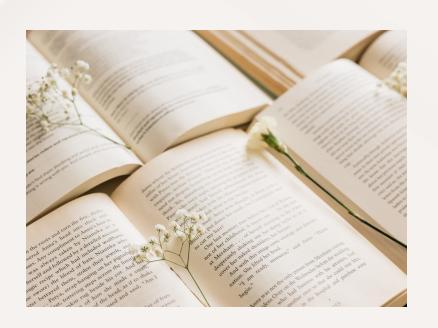
GUIDANCE AND PROFESSIONAL DEVELOPMENT

We take great pride in rigorous academic standards, high-quality instruction, and comprehensive curriculum development to ensure that students receive a world-class education in spiritual healing modalities.