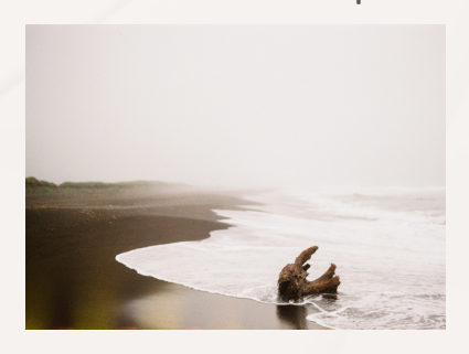
EXCELLENCE IN FDUCATION